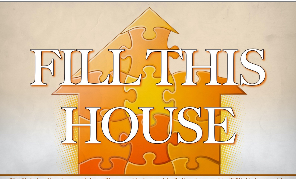
"'I will shake all nations, and they will come with the wealth of all nations, and I will fill this house with glory,' says the LORD of hosts" (Haggai 2:7).

God has done His part by imparting to us divine grace, mercy, and forgiveness. Praise be to God. But are we doing our part? You see, that's faith! "For by grace are ye saved through faith" (Ephesians 2:8). Grace, that's God's part, and faith, that's our part. Faith (trust) is active, it is trust, obedience, and confidence in the plan of God. This is what will ultimately save us eternally from our sins. Yes, God has done His part and continues to be faithful. What about us? Where are we putting our faith?