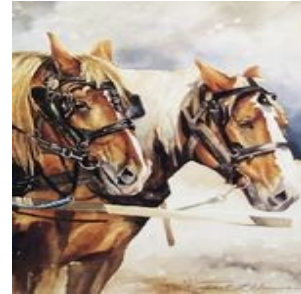
“Honesty” & “Integrity” (Power & Grace)

Have you ever experienced conflicting standards in your life? We all have met people who were very dogmatic about being sound in doctrine, morally upright, or habit free and violate good judgment in some other realm in life that may be as ungodly, or more unacceptable than, the object of their dogmatic protest. The position they are taking may be absolutely correct and commendable, but there must be a consistency.